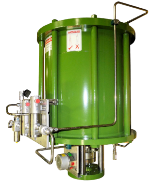
Figure 1. PNL linear actuator final assembly

The PNL&HYL valve actuator is designed to operate any sliding stem valve at supply pressures of 2.7 to 12 BAR (pneumatic) and 250 BAR (hydraulic) with an output thrust range of up to 222kN.