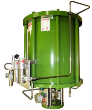
Figure 1. PNL linear actuator final assembly

The PNL&HYL valve actuator is designed to operate any sliding stem valve at supply pressures of 2.7 to 12 BAR (pneumatic) and 250 BAR (hydraulic) with an output thrust range of up to 222kN.